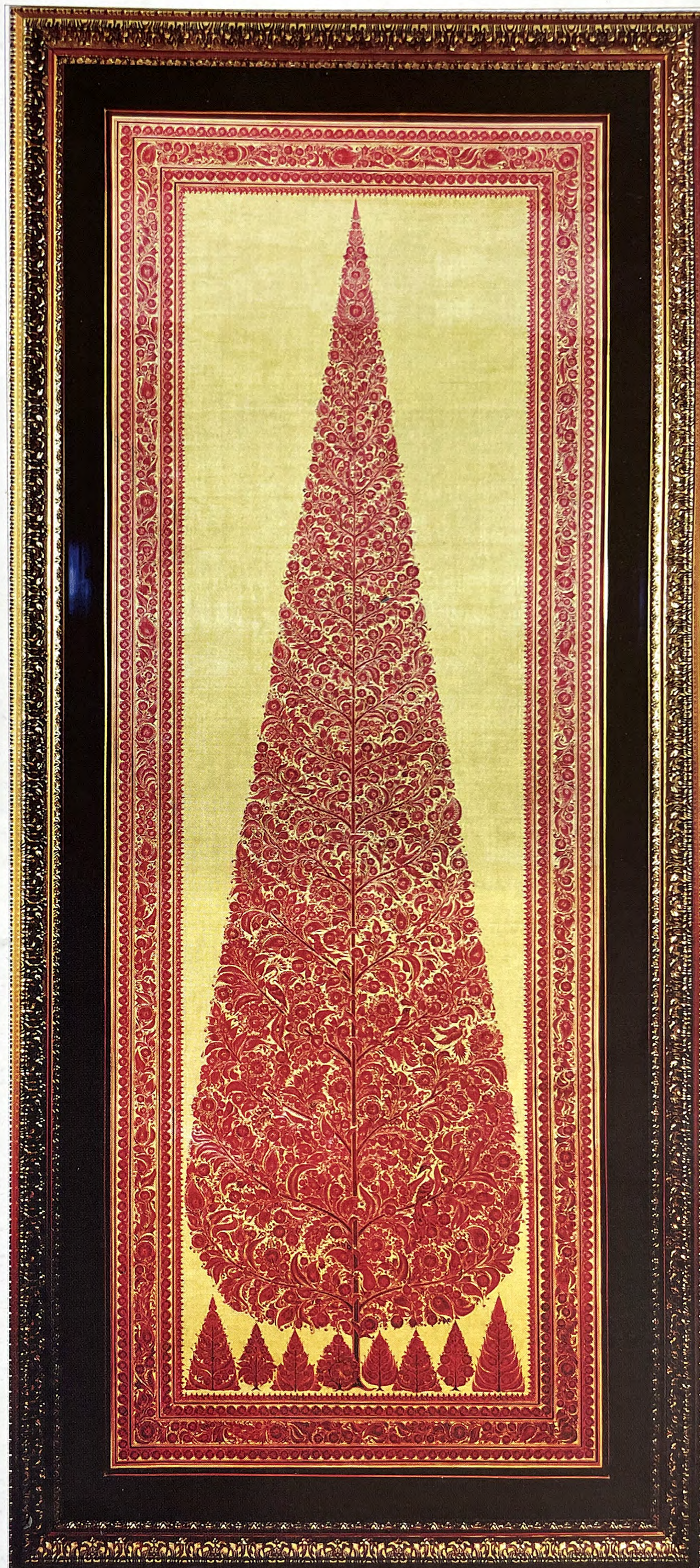
Pattachitra depicting 'Tree of Life' by Kailash Chandra Meher, 28"X75", natural colours on silk

Over the last decade, Galleria VSB has collected and restored some of the finest old master works of Pattachitra, perhaps the oldest traditional Indian Art, being practiced for