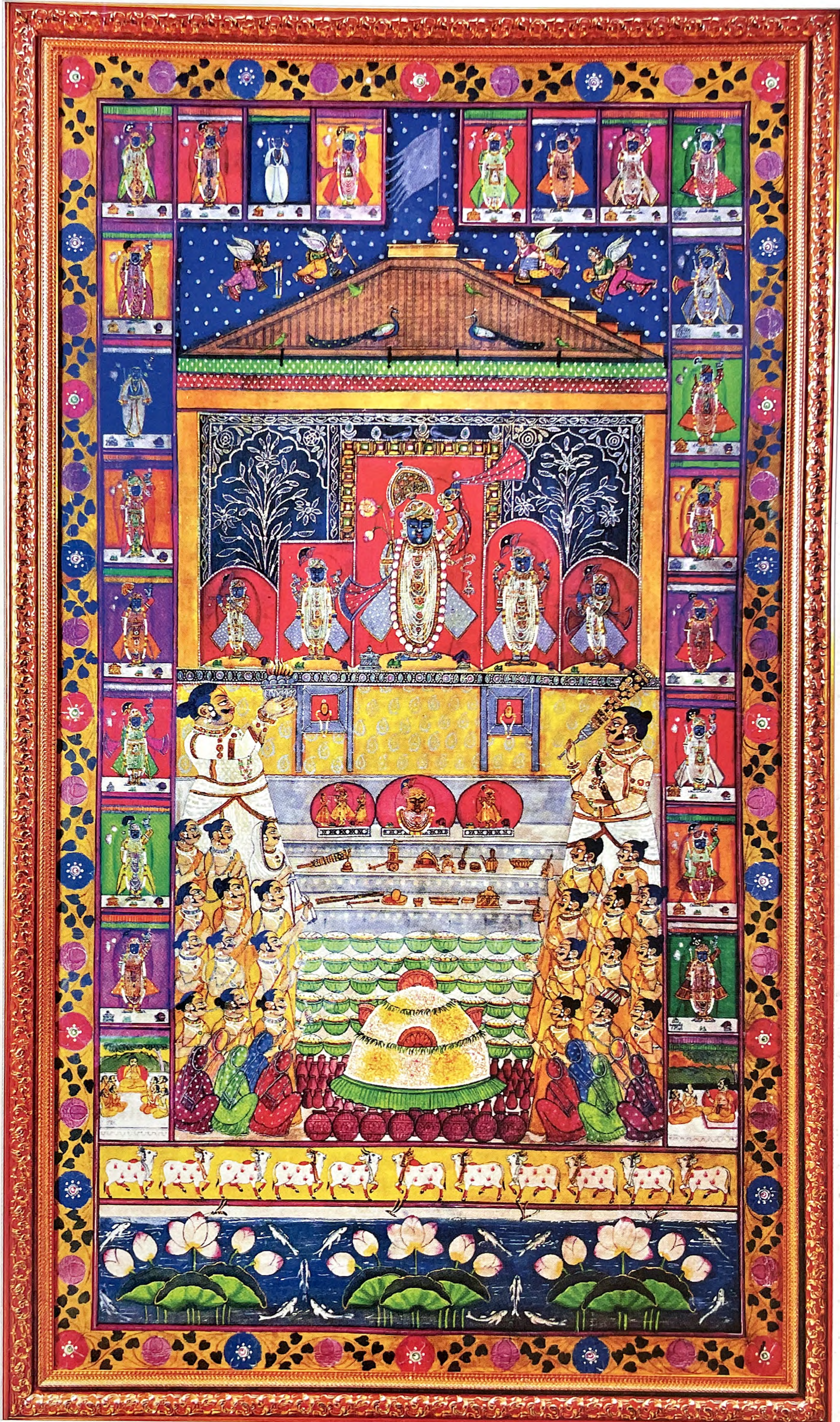
Old Pichwai (restored), 43"x75", vegetable/ mineral colours on traditional cloth