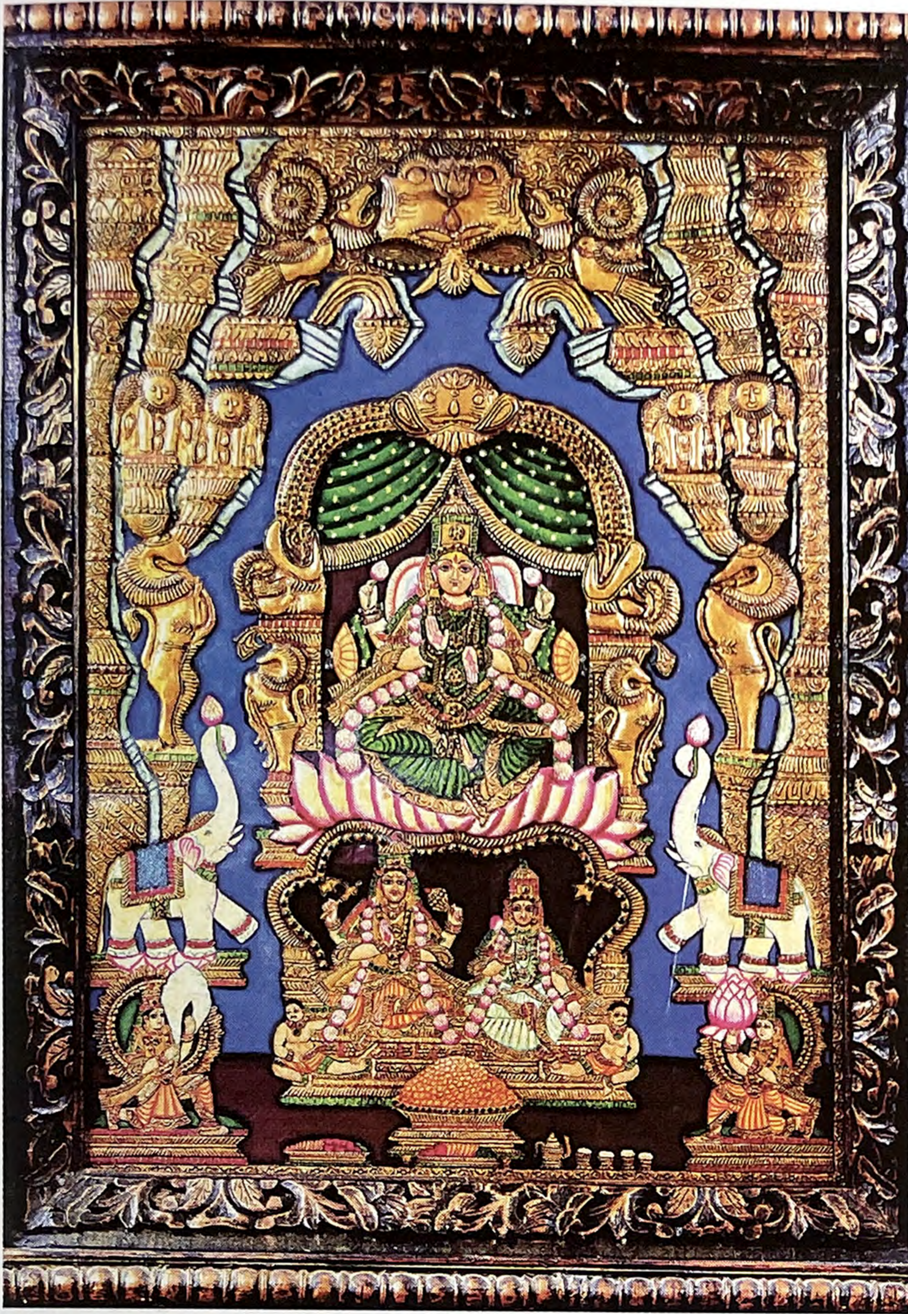
Old Tanjore Painting (Restored) depicting Goddess Lakshmi , 36"x48", Natural colours and gems on wooden plank