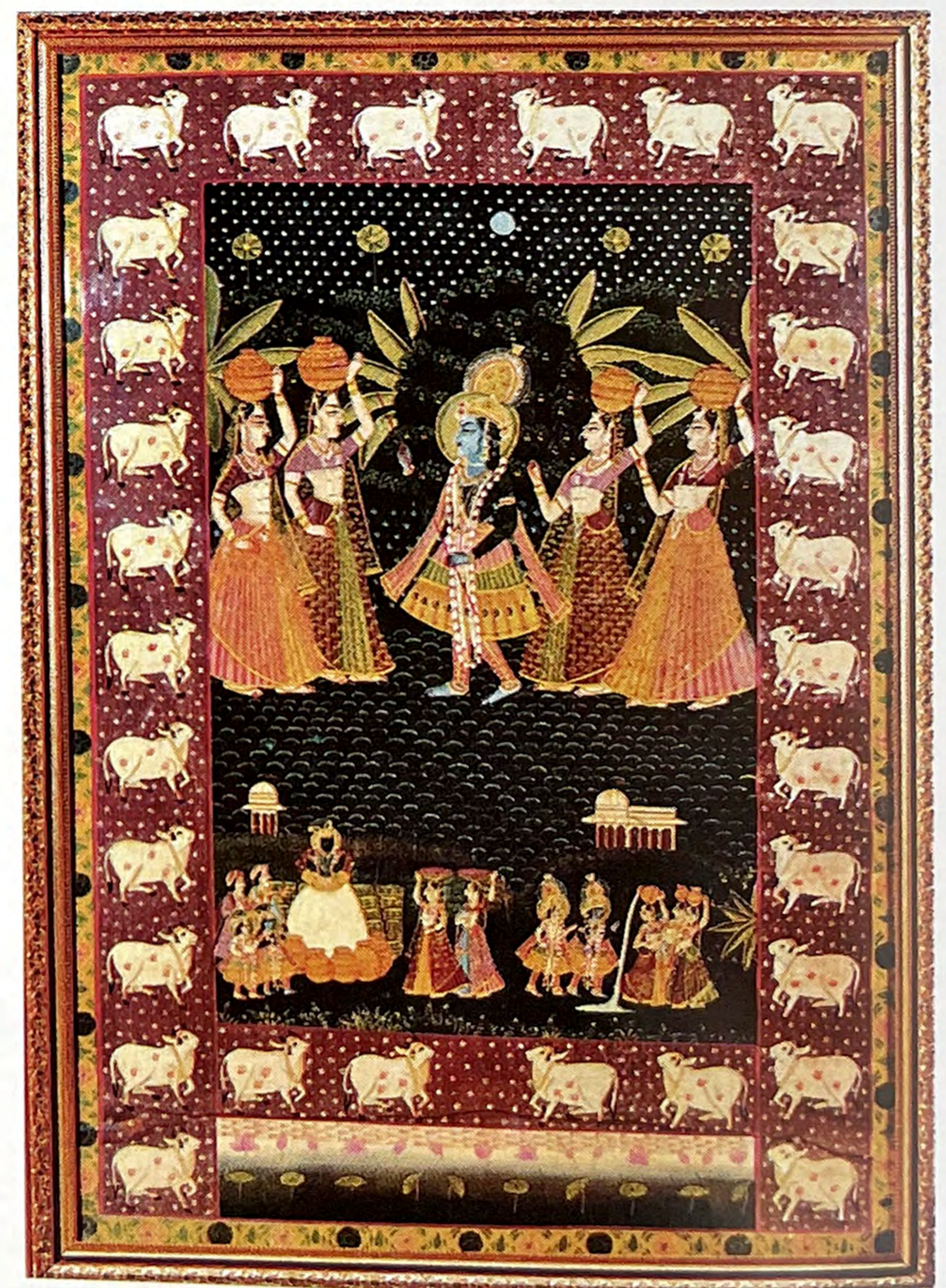
Old Pichwai (restored), 45"x68", vegetable/ mineral colours on traditional cloth

Rare old Pichhwais from Nathdwara is yet another entrancing collection at Galleria VSB. This form of art is fast declining since it is extremely difficult to make Pichhwais and the work is very intricate and time consuming. Pichwai literally mean a backdrop. However, for the artists of the holy town of Nathdwara in Rajasthan, these have remained a form of art,