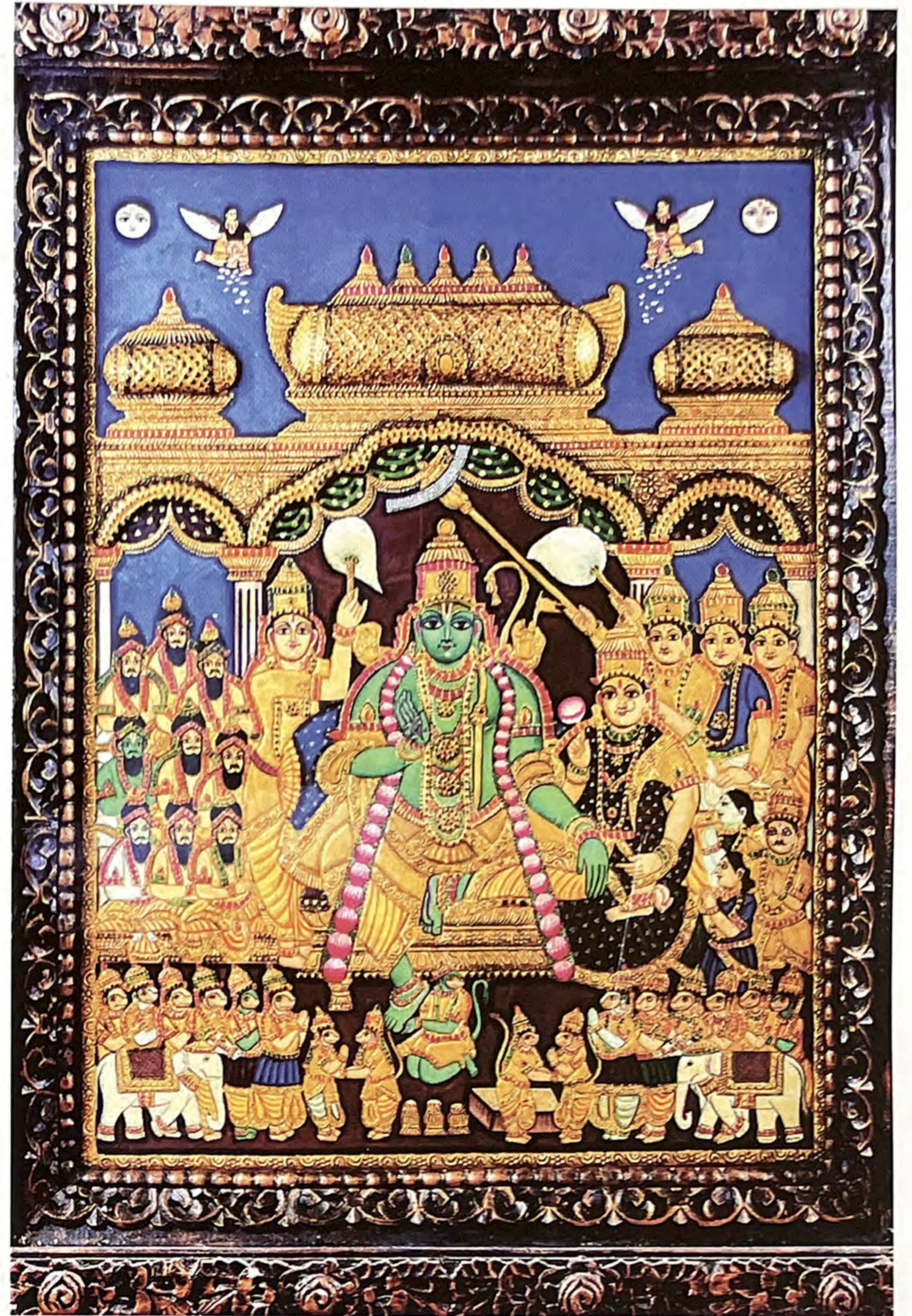
Old Thanjavur Painting (Restored) depicting Lord Ram's Durbar, 36"x48", natural colours and gems on wooden plank

Pattachitra works are also experimenting with new themes depicting religious stories, individual paintings of gods and goddesses and social processions. Be it our old Pattachitras or the contemporary ones, they retain their glamour. These paintings, done on silk or canvas with rich colour applications, portrayals of simple themes with creative motifs and designs, are simply enthralling.