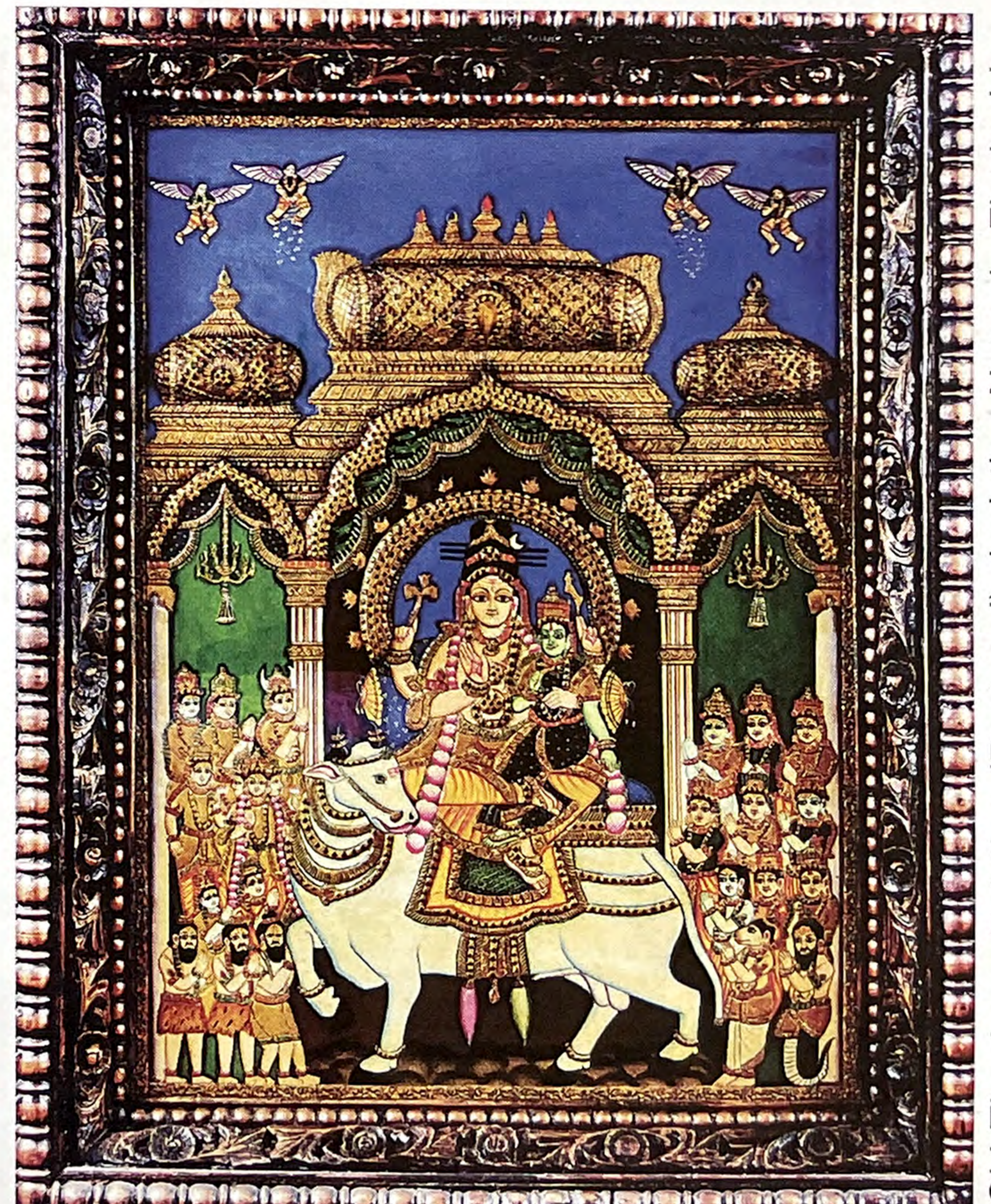
Old Thanjavur Painting (Restored) depicting Nataraja Flanked by Sivagami, 36"x48", natural colours and gems on wooden plank

Another fascinating collection at Galleria VSB deserving a specific mention comprises rare and classic Thanjavur paintings. Curators Vandana, Swati and Varun enthusiastically reveal the efforts and time devoted by the Gallery to procure these rare old Thanjavur works framed in solid rose wood. Each Thanjavur paintings along with the frame weighs between 50 to 100 kgs, comprising the weight of the wooden plank on which the paintings have been done along with the weight of the frame. A simple look at these works generates an oomph in you. Vandana adds that these rare Thanjavur paintings when procured carried a lot of dust and faded colours at