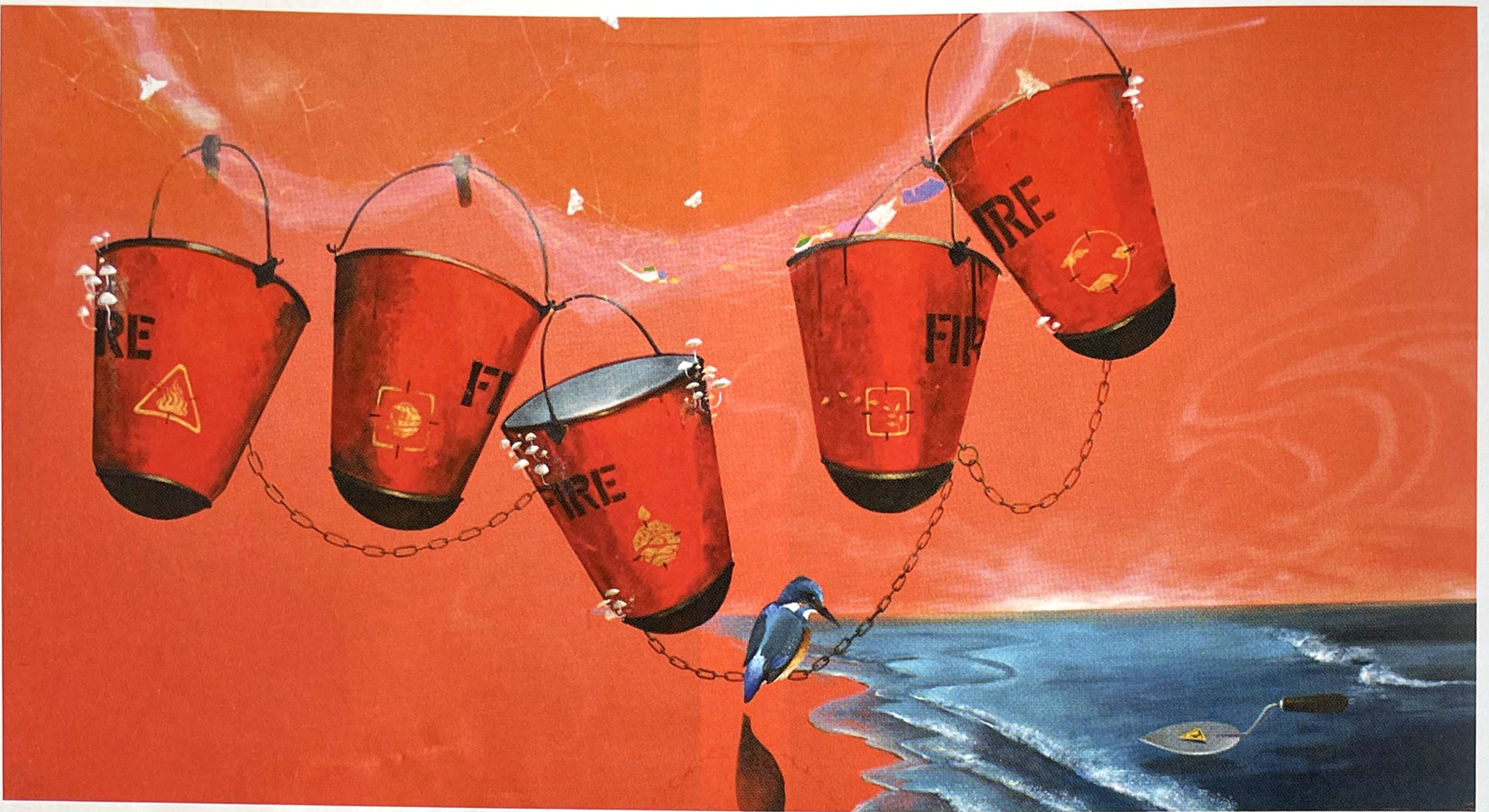
Focus to Five Elements