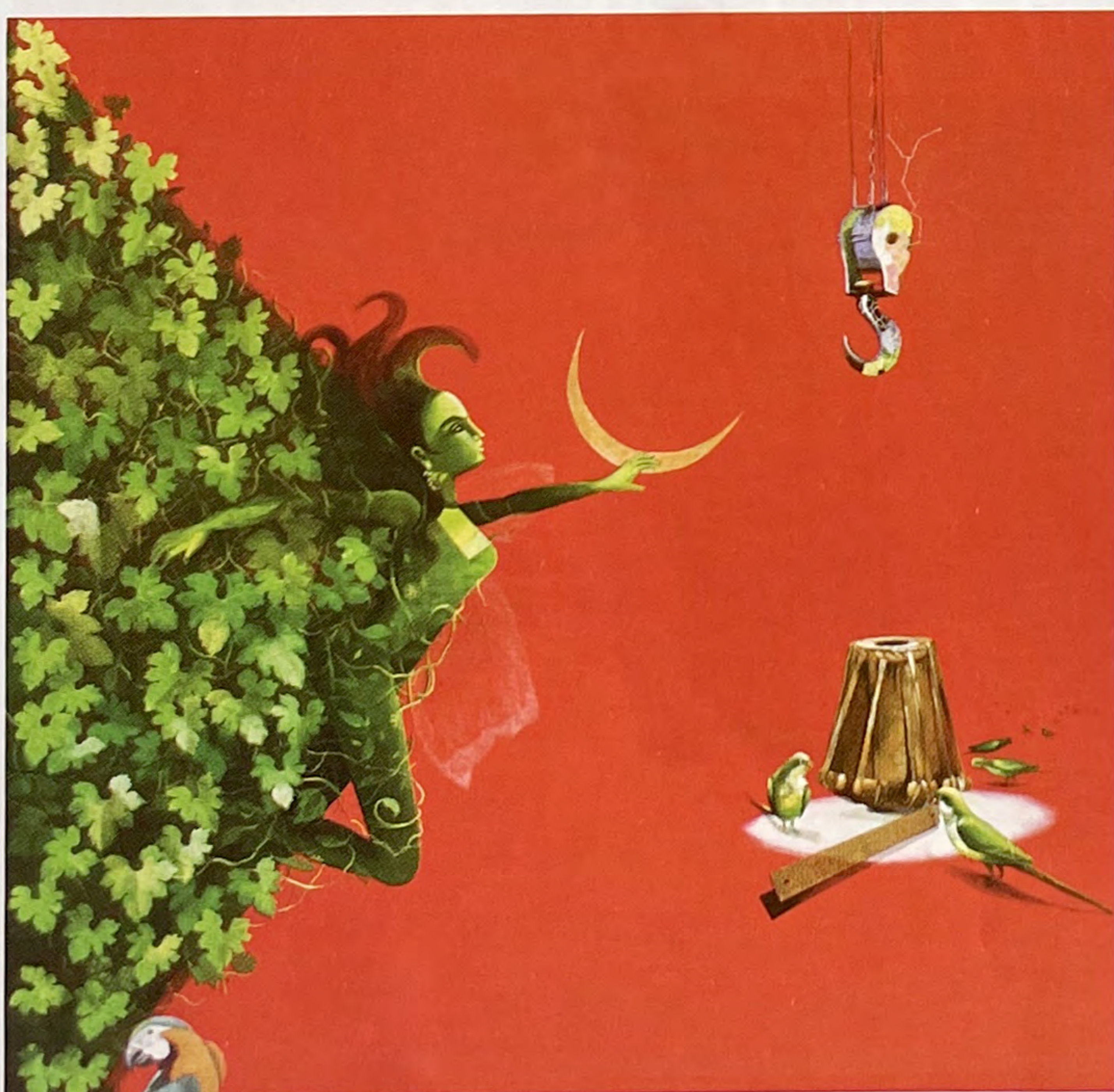
Harmony in Life, Acrylic on Canvas, 48"x48"