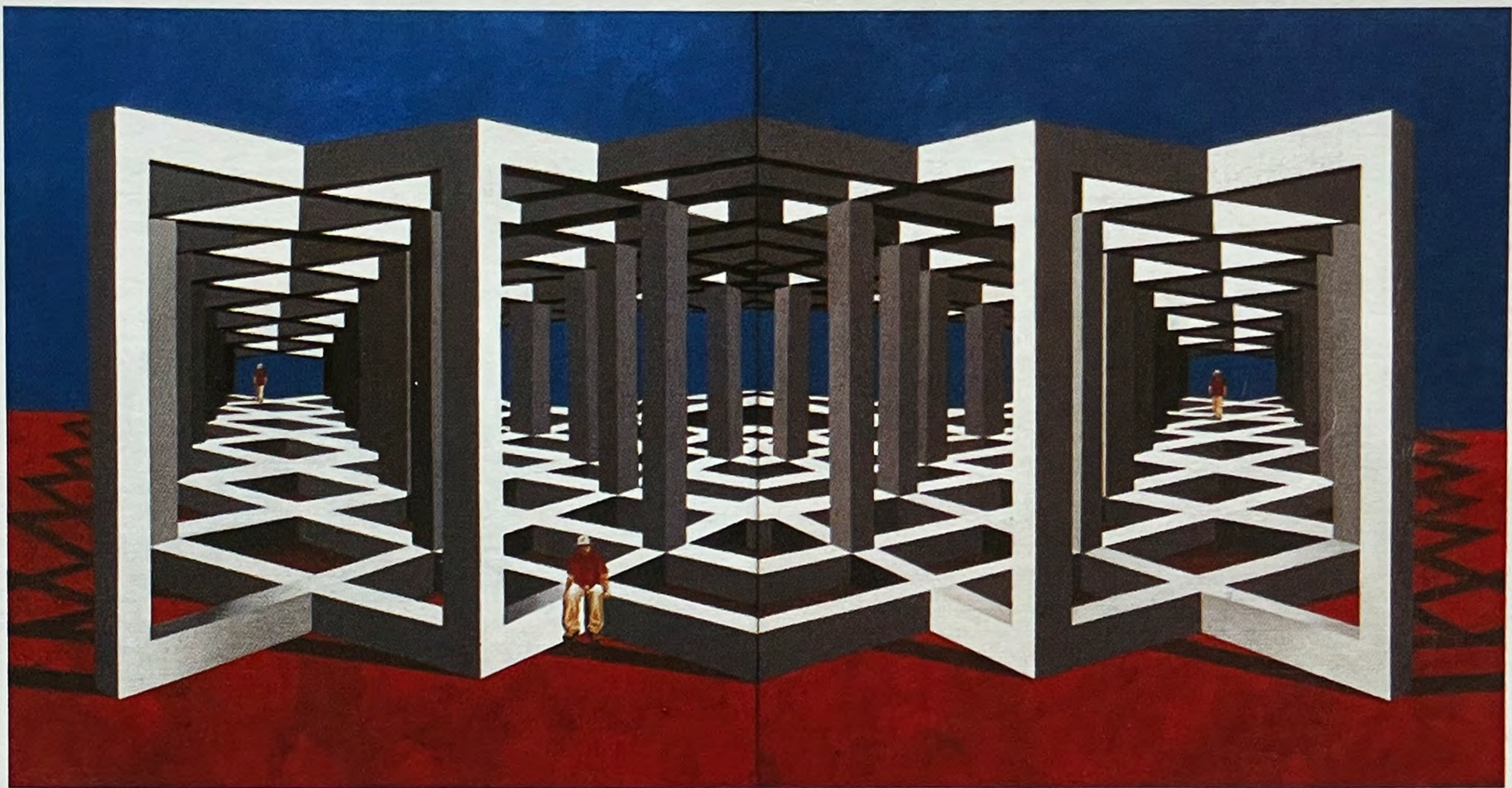
Inner Quest, (dyptic), Acrylic on Canvas, 8'x4'