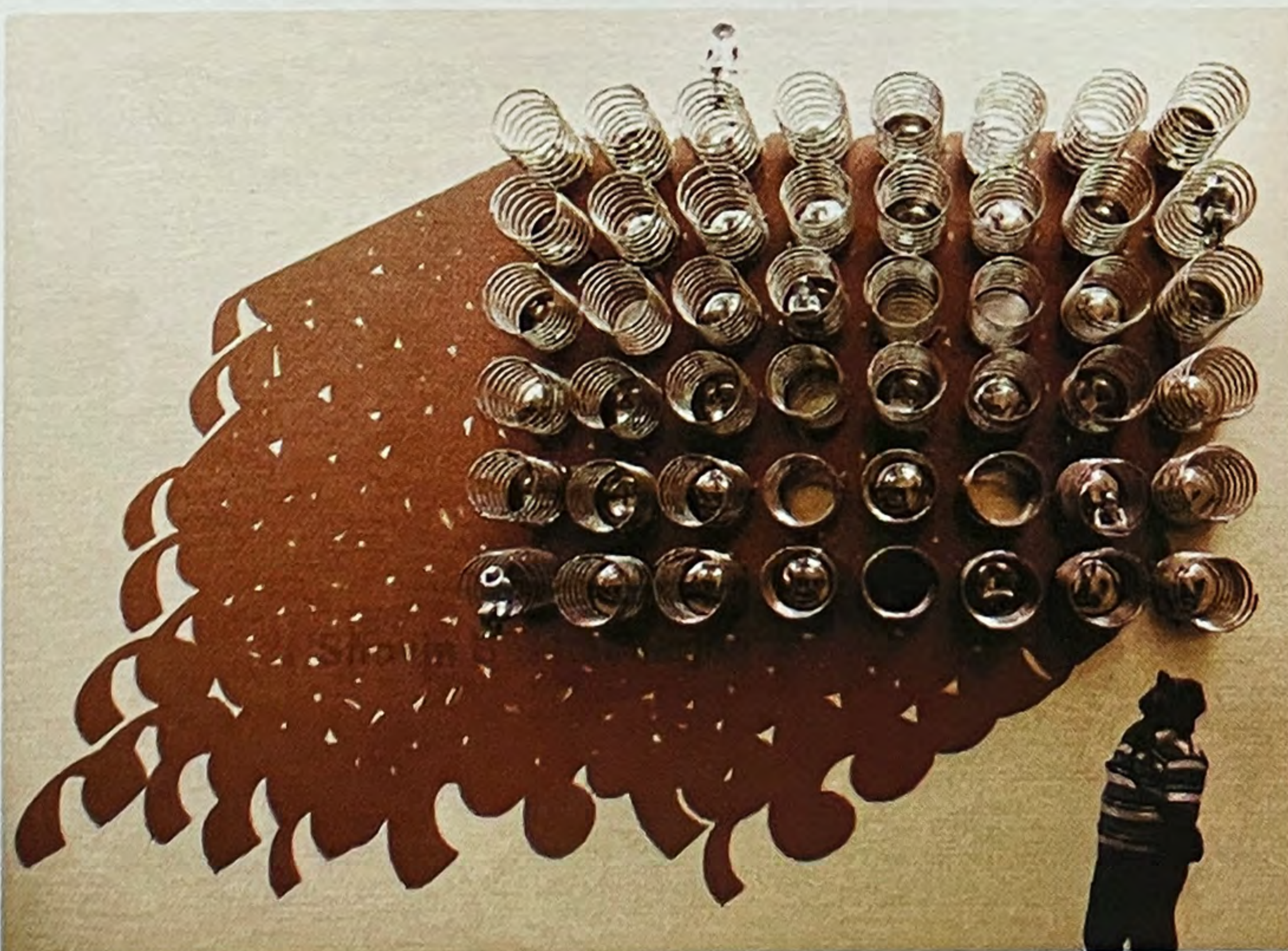
Inner Quest (Installation), Medium : Stainless Steel, Fiber Glass and Painting on the Wall, 22'x17'x2'