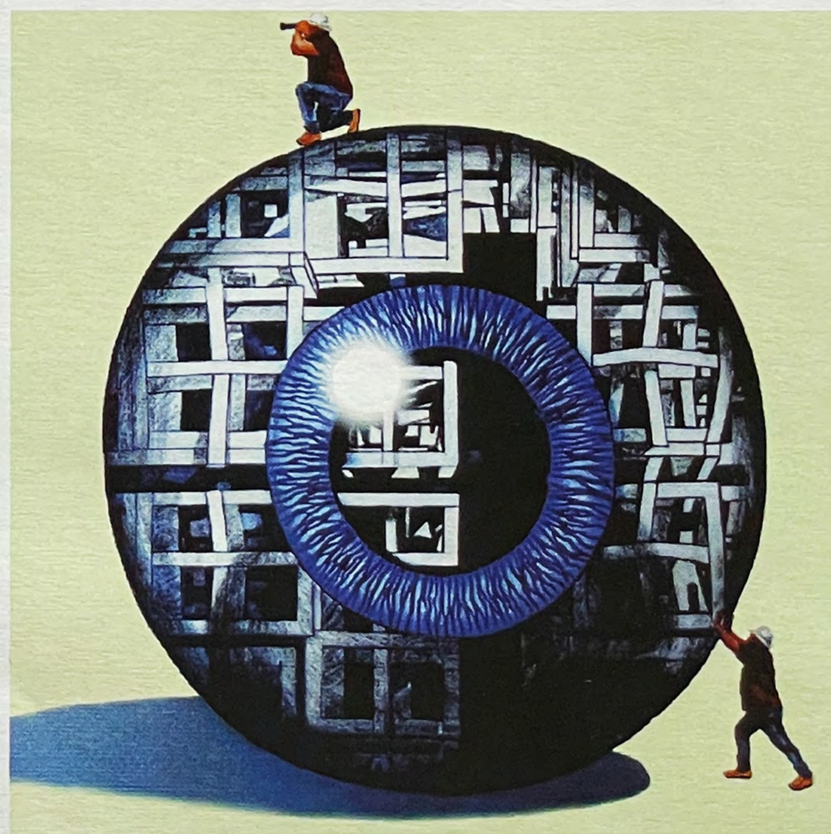
Eye, Acrylic on Canvas, 3'x3'

toward any single kind of art practice, and his computer mouse is also his paint brush! His varied experiences in the field of arts interestingly extend