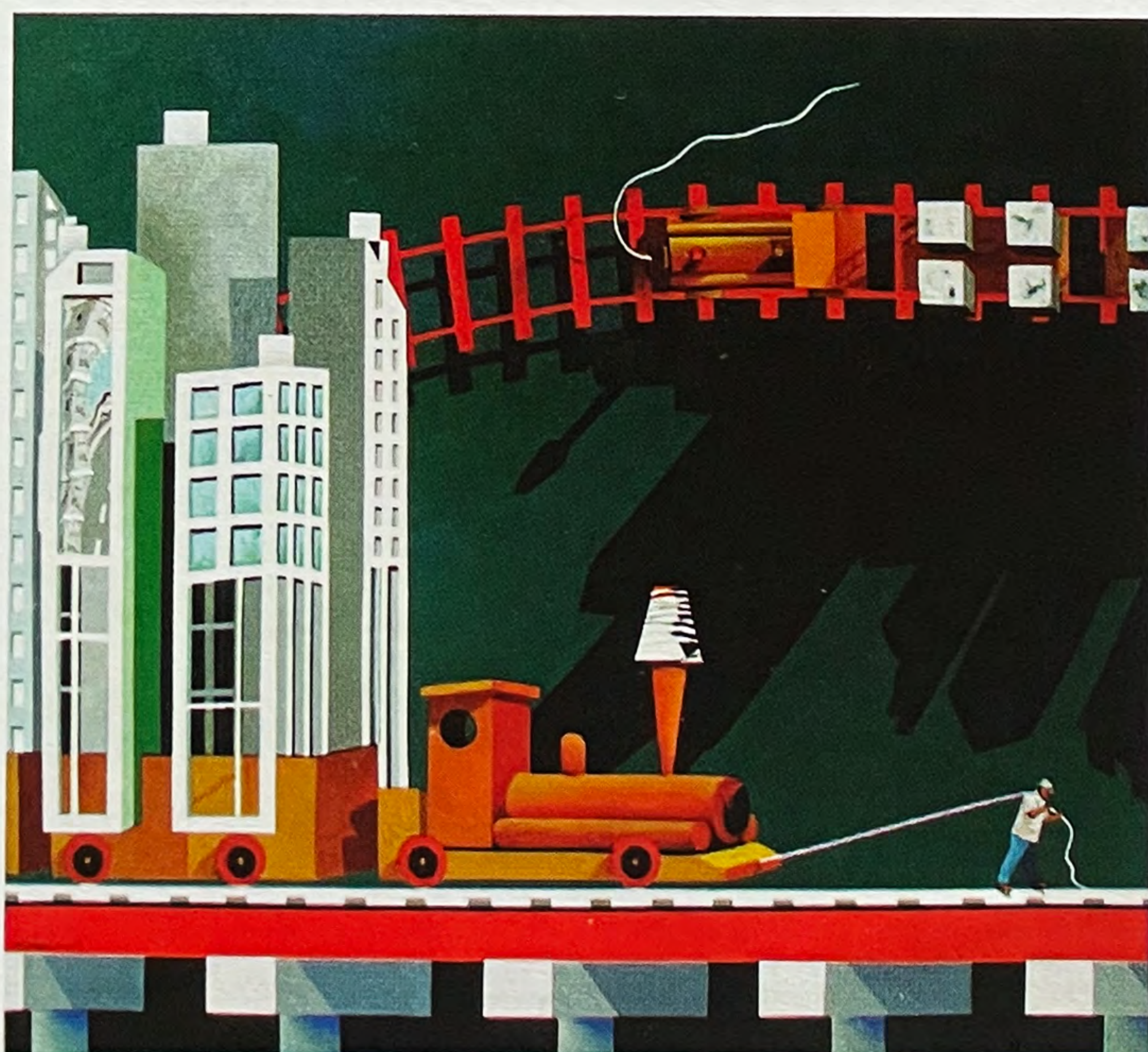
Rail Habitat, Acrylic on Canvas, 4’x5’

Exploring the idea of absolute space, surreal ideas, absurdity, lampoon and satire, Shovin creates a wonky world that will make anyone think if the Gods were actually crazy?! ■