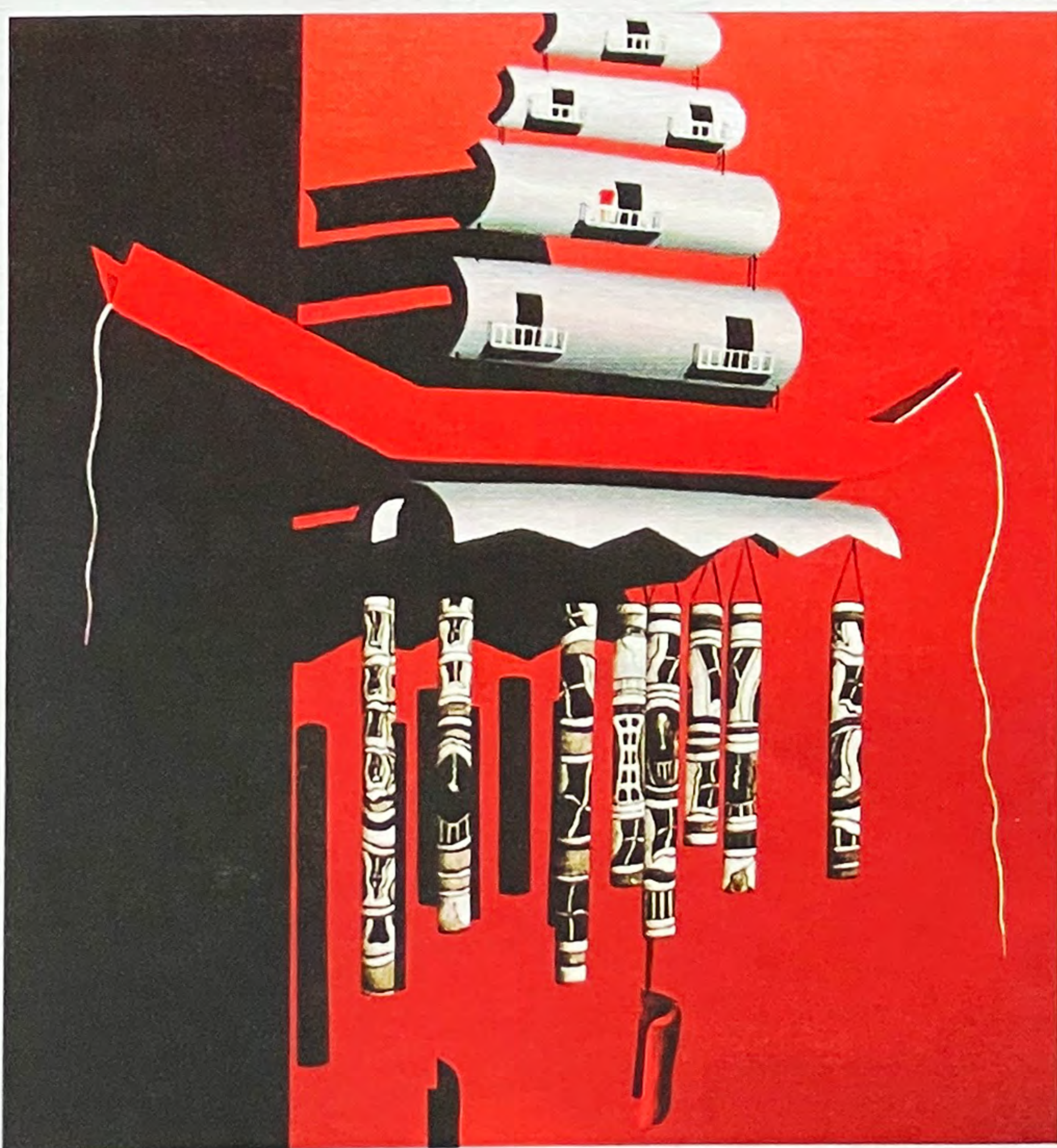
Wind Chime, Acrylic on Canvas, 4'x4'