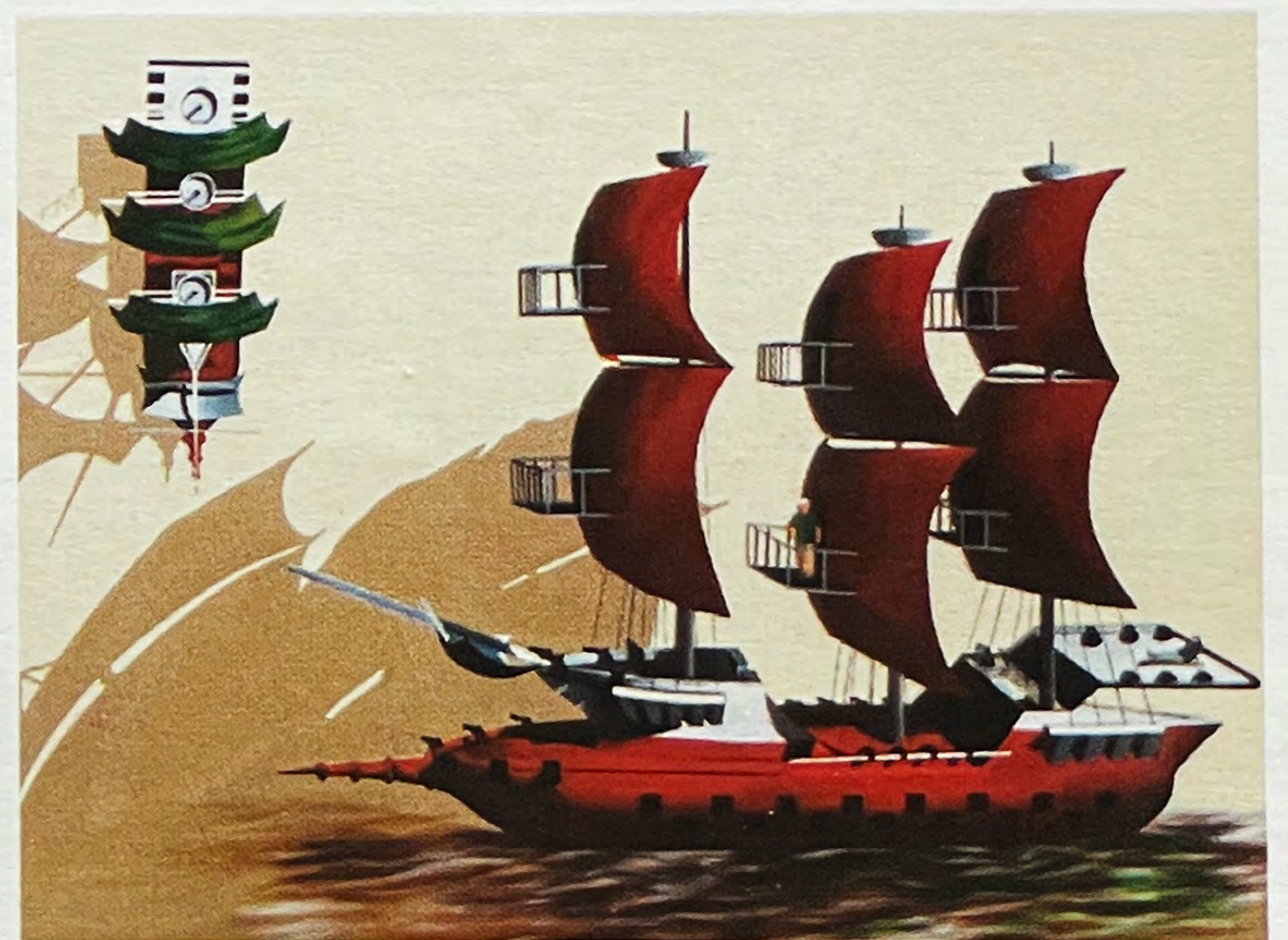
City on Water, Acrylic on Canvas, 4.5'x6'