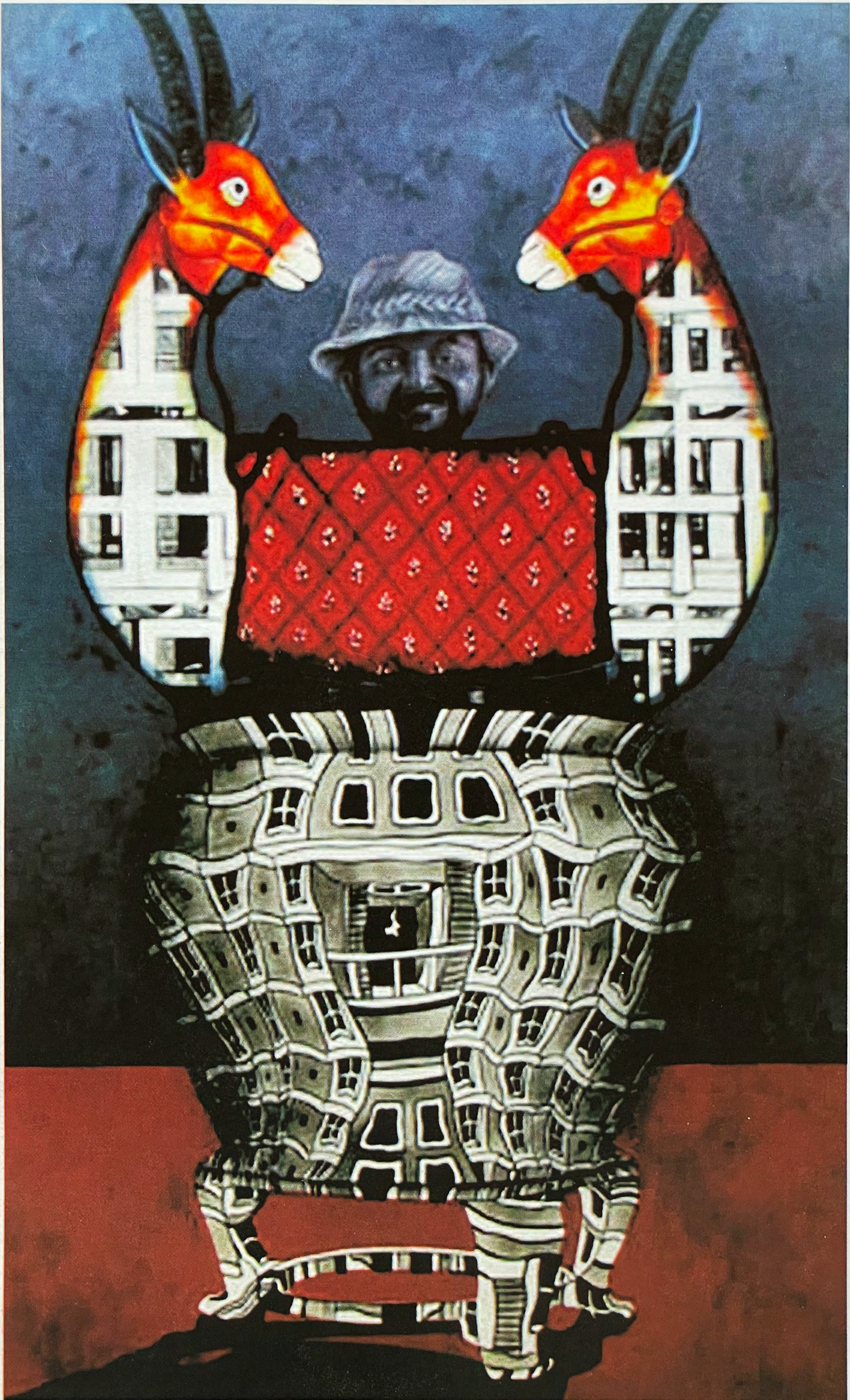
Untitled, Acrylic and Charcoal on Canvas, 5'x3'